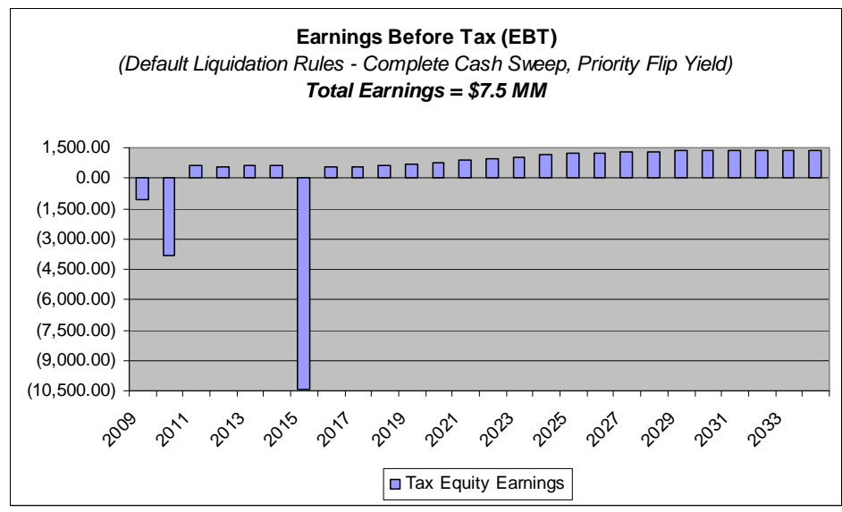
Figure #1: EBT using Default Liquidation Rules

Figure #2 shows the HLBV results of a liquidation waterfall modified with PEP to address (1) post-flip deferred tax liabilities (minimum gain), as well as (2) losses in the early years. The total earnings are still the same in both graphs; however, there is a much improved sharing of the earnings between the partners with the PEP case, though some smaller losses have now been pushed to later years.