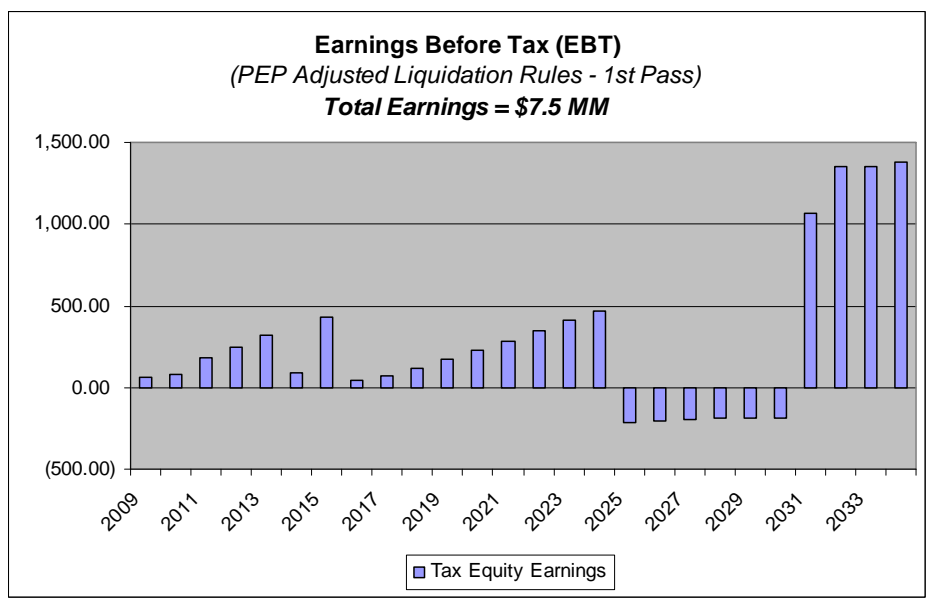
Figure #2: EBT with PEP, 1st Pass

Figure #2 shows the HLBV results of a liquidation waterfall modified with PEP to address (1) post-flip deferred tax liabilities (minimum gain), as well as (2) losses in the early years. The total earnings are still the same in both graphs; however, there is a much improved sharing of the earnings between the partners with the PEP case, though some smaller losses have now been pushed to later years.